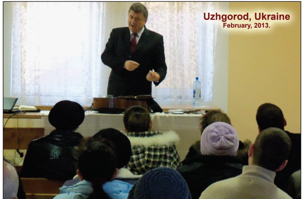
Uzhgorod, Ukraine February, 2013.