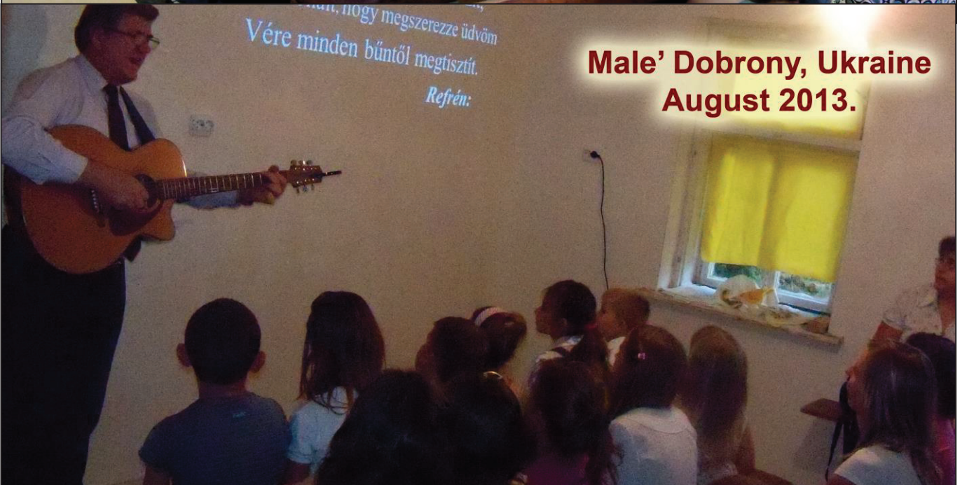
Male' Dobrony, Ukraine August 2013.