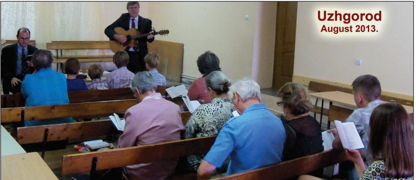
Uzhgorod August 2013.

which was like a camp for about 25 children. We had intensive teaching program each day, and on Sunday we preached the Gospel to the parents, both in Kisdobrony, and in Ungvár. Six new parents came, who never came before to our services. It was encouraging to see the lady who was converted one year ago, is still very dedicated.